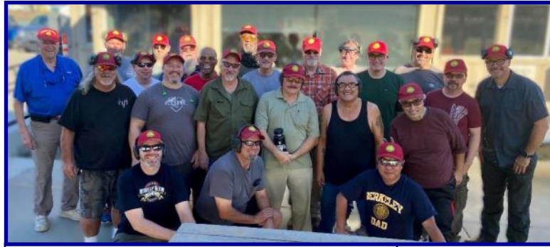
A few of RRGCC's Pistol & Rifle Range Volunteer Range Safety Officers

Guest of Member: $10/hour—Member must be present