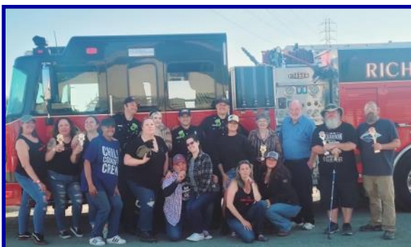
A big "Thank-You" to the Richmond Fire Department for their help in judging this year's Cook-Off!